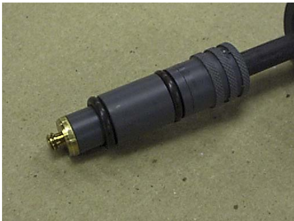
Underwater Male Connector