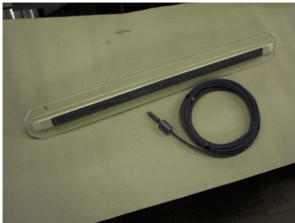
Anode & Underwater Connector Cable

The CerAnode Underwater Connector (pictured below with a Strip Anode) makes installation easy and connection integrity foolproof. It features <100 micro-ohm electrical resistance and a high pressure environmental seal. Our Disk Anode, Strip Anode and special Reference Electrode feature these dielectric mounting studs eliminating any additional dielectrics or spacers. O-Ring and Compression seal technology is used to assure foolproof environmental isolation. The underwater connection allows for diver replacement if retrofitting is ever required.