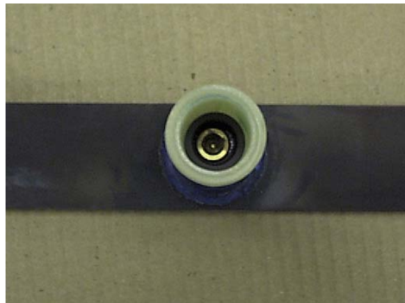
Underwater Female Connector